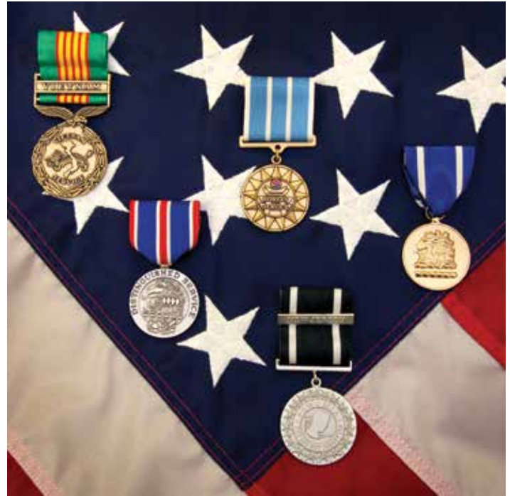
New Jersey's state awards. Clockwise, starting top left: New Jersey Vietnam Service Medal, New Jersey Korean Service Medal, New Jersey Meritorious Service Medal, New Jersey POW-MIA Service Medal and the New Jersey Distinguished Service Medal.

This medal is awarded to combat veterans who were not New Jersey residents when they entered the military service, but who are current New Jersey residents and have resided in the state for the previous five years. All other qualifications are the same as for the Distinguished Service Medal.